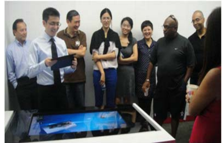
Business Visit to China Golden Bridge Technology & Service Co., Ltd.