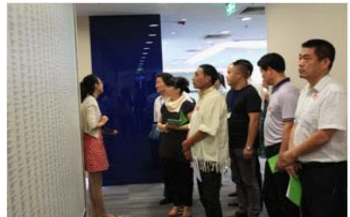
Business Visit to IBM Client Center in Beijing