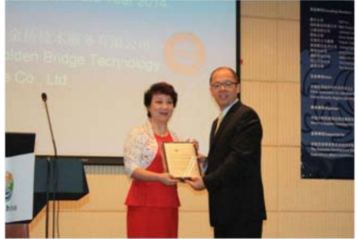
Minority Supplier of the Year - China Golden Bridge Technology & Service Co., Ltd.