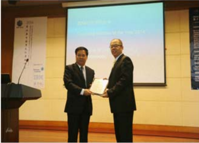
Corporate Member of the Year - IBM Corporation